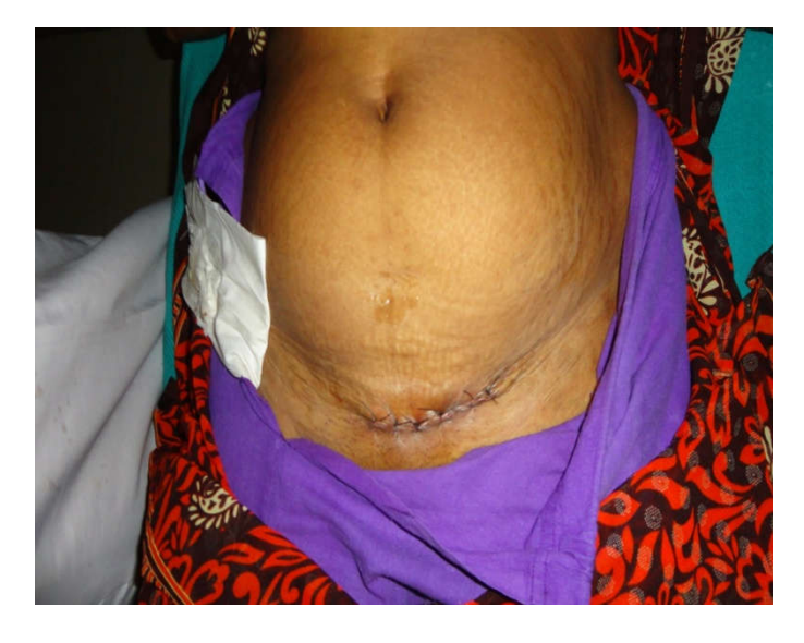
Fig 1.3. The postoperative wound status