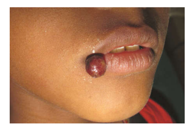
Figure 1. Clinical presentation

Based on this investigation, a digital substraction angiogram was advised to rule out the feeder vessel. Angiogram revealed that there was no evidence of abnormal draining veins except that the lesion was fed by right labial artery with no evidence of calcifications or phleoliths; thus, giving an impression of a vascular malformation. The Lesion was provisionally diagnosed as haemangioma. As the growth had bleeding predilection, it was ligated with BBS suture at the base of lesion. On recall after two days, lesion had shrunken in size with a change in color to black and no evidence of bleeding [Figure 2]. Lesion was excised under general anesthesia. Patient was recalled after 10 days and healing was uneventful. On three months recall, healing was satisfactory with presence of scars on right corner of lower lip [Figure 3].