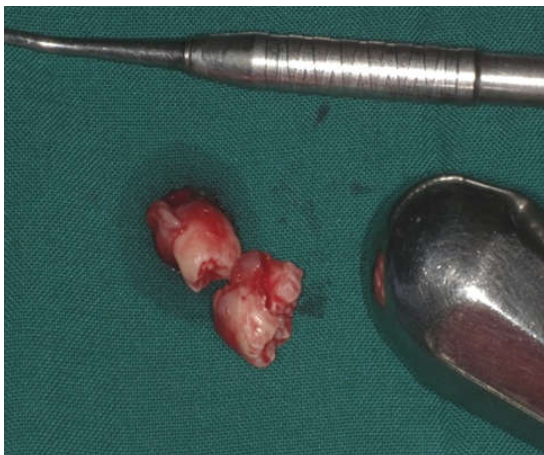
Figure 4. Extracted teeth

On histopathology examination, a given specimen shows parakeratinized stratified squamous epithelium with underlying connective tissue stroma. Fibrous connective tissue shows high cellularity with diffuse, moderate chronic inflammatory cell infiltrate and numerous endothelial lined blood vessels are seen. [Fig.no.5&6] Based on histopathological reports, it was diagnosed as 'Pyogenic granuloma'.