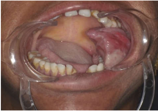
Figure 1. A pedunculated swelling seen on the left buccal mucosa