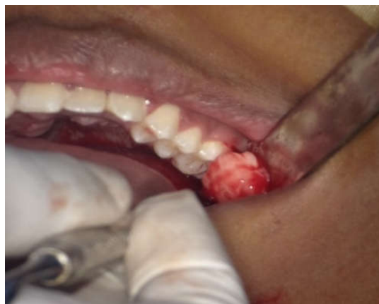
Figure 3. Teeth extracted out of the socket