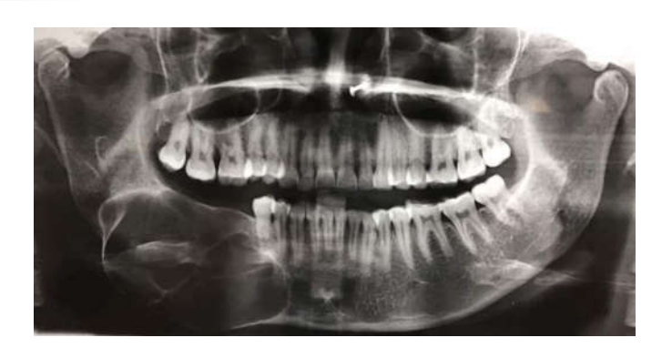
Figure 1. OPG showing well defined multilocular radiolucent lesion with smooth margin

Advanced Imaging like MRI finding in Keratocystic odontogenic tumours shows T1: high signal due to cholesterol and keratin contents. T2: heterogeneous signal. DWI: restricts due to presence of keratin. T1 C+: peripheral enhancement but unlike ameloblastomas no enhancing nodular component