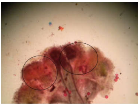
Fig.1: Presence of esterase over stigmatic surface.

+++ : High. ++ : Moderate. + : Low. --- : Absence