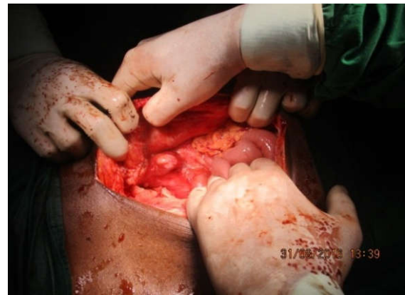
b. Normal Right Testis at Internal ring