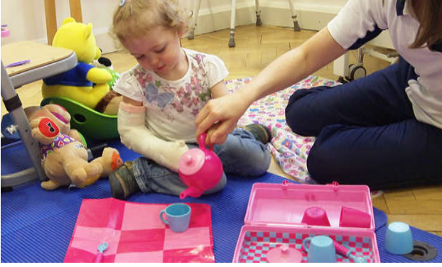
Also, hand function was most severely impaired in the group with subcortical/cortical lesions, (Wiklund and Uvebrant, 1991). From an early age, children with a unilateral

impairment will tend to use their non-affected hand as the dominant hand even when the actual functional loss is mild (Krumlinde-Sundholm et al., 1998). Over time these children learn to disregard the affected arm which has the potential to lead to further impairment including increased muscle tone, poor motor control, decreased active and passive range of motion of the joints of the limb, generalised weakness and a delay in skeletal maturation (Roberts et al., 1994; Scrutton et al., 2004). Another important factor which may contribute to a developmental disregard of the affected upper limb in a child with hemiplegic cerebral palsy is the presence of mirror movements. These occur when repetitive voluntary movements of one hand are accompanied by involuntary mirrored movements of the other hand (Kuhtz-Buschbeck et al., 2000). Considered to be normal early in motor development, mirror movements are observed to be more pronounced or are prolonged with childhood hemiplegia. The mirror activity was associated with poor bimanual coordination (Kuhtz-Buschbeck et al., 2000).