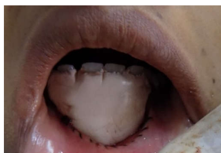
Figure 4. Periodontal pack placed