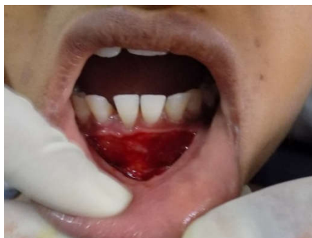
Figure 2. Horizontal incision placed