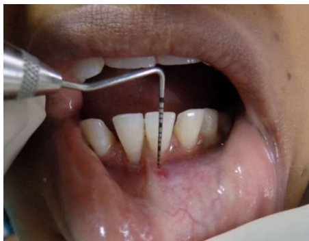
Figure 1. Preoperative view

vestibular depth and width of attached gingiva was obtained. No post operative complications and signs of relapse were seen after 6 months (Figure 5).