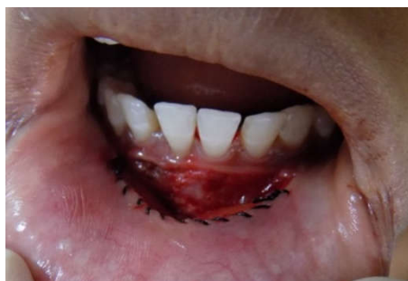
Figure 3. Flap undermined and sutured with continuous Locking suture