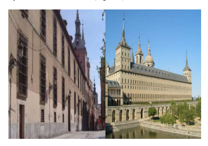
Figure 4. comparison between the facade of the Escorial and the monastery

Brief clarifications on the work of the Escorial: On this facade I will explain what I was saying about El Escorial. Do you see this fake run? The windows above support this impost and the one below supports below. This was the escurialense way that Sabatini had copied when he made this facade, now it is not appreciated because it is not restored but this sign is repeated on all four facades (Figure 4).