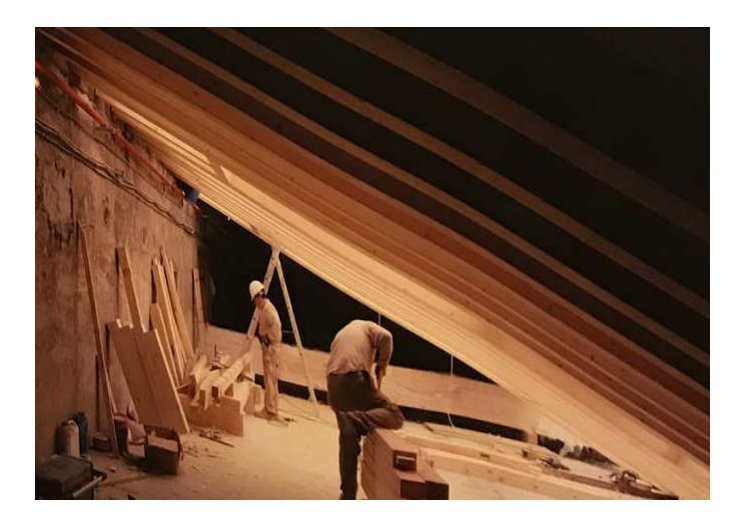
Figure 6. wood restoration works

put the material recovered from the previous actions. Continuing on our tour, he explains to me that where the wall has no continuity because it is not locked, in order to improve and ensure stability, it inserts a "candula" that crosses the walls to join simulating a seam. To ensure the union does not use resin because it is cold factory and the use of the resin does not ensure penetration until the end of the material, in addition that the temperature contrast creates a thermal shock that is not good at all. With a brief subsection, he explains to me that nowadays chains are not used for the restoration of monuments, but carbon fiber, building a ring around the monastery and preventing the displacement of the walls. To finish with the recovery of the wood attacked by termites, when the thickness of it exceeds 5 cm, we put the spigots of no return. In the course of my work on site I am moving aside and recovering material that I imagine can be useful for the restoration of other works.