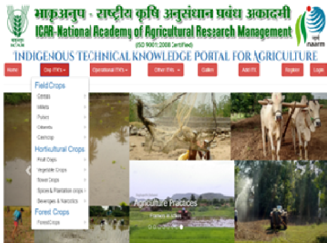
Fig. 4. Menu Options for the ITKPA