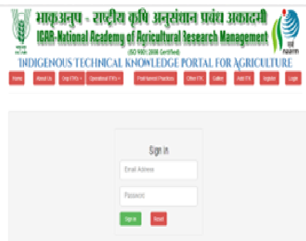
Fig 2. Registration and login for the ITK Portal