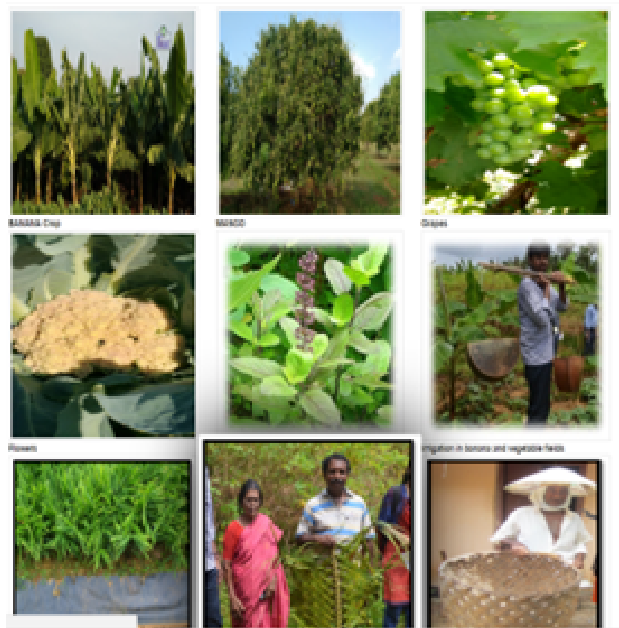
Fig 8. Photo gallery of the ITK resources

We need to tap this potential resource of ITK to our benefit. This Portal can contribute and document all information of ITK resources and help prosperity. The portal was developed by ICAR-NAARM, using PHP and MYSQL, which provides information resources on ITK resources of pan India for crops viz., cereals, millets, pulses, fruits & vegetables, spices, medicinal & aromatic, plants etc. has been developed with an aim of providing technical information to the researchers. This portal would facilitate effective utilization of ITK in Indian Agriculture.