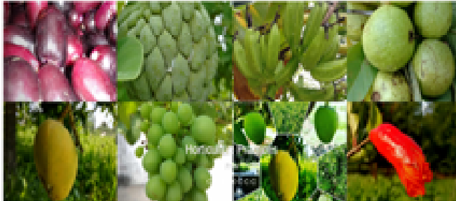
Fig. 3. Home page for the ITKPA

The Portal is designed in PHP and My-SQL at the backend and the interface is created using PHP in HTML format. The webpage interface is interactive and is designed keeping public in mind for easy access of their desired data. The database is very rich and up-to-date with information from latest state wise cereals, pulses, millets, vegetables and fruits, spices, medicinal & aromatic plants. The details of the information contain in the portal is shown in the following figures (2-8).