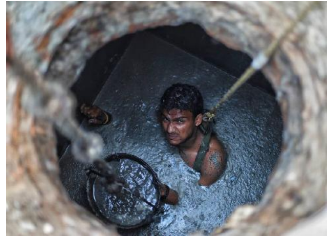
Figure 1. Manual Scavenging

A proper sewage system should be initiated everywhere, but the fact is that many cities do not have sewerage that covers the whole city. As already discussed, sewage lines are connected to storm water drains due to which sewerage get clogged and demand human intervention. Open drains, are also badly designed, allowing people to dump solid-wastes into them, which accentuates the problem. Improper disposal of plastic bags and bottles, napkins and other materials leads to the clogging of drains. Few people take up this lowly job, not knowing that human faces and urine harbor a variety of diseases. They may carry Hepatitis A, E.coli, Rota-virus, Nor virus, and pinworms. The manual scavenging leads to the high risk to life of workers, while coming in contact with the toxic wastes. And this is the reason why sewer workers die as young as 40, falling prey to multiple health issues: cholera, hepatitis, meningitis, typhoid and cardiovascular problems. In fact, repeated handling of human waste without protection results in respiratory and skin diseases, anemia, jaundice, trachoma and carbon monoxide poisoning. It is not possible to totally eliminate manual scavenging unless we create the right