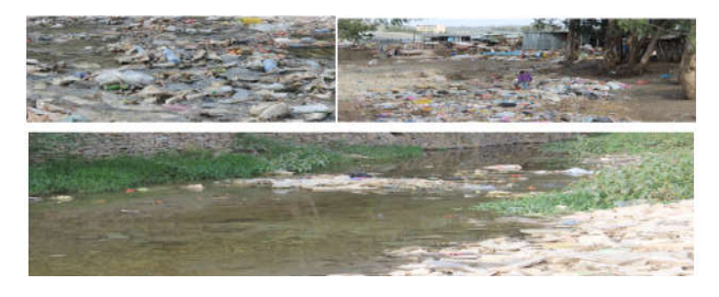
Photograph 1. Unsanitary Working Condition of SFVs Table 2. SFVs maintain records or accounts

Bhowmik (2005) stated that in Bangladesh SFVs was frequently victimized by the police and local government authorities. Nurdeen A.A (2014) explained that 60% of the vendors prepared their food in an unclean environment with the presence of flies and dumps all over the places. This implied that SFVs work in unclean, risky working place and also due to their informality they face eviction and removal by municipality workers from they operate. Moreover, the income that gained from the business was too much low.