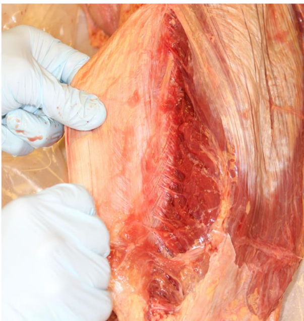
Figure 2 Tissue renewal rate for densified fascial structures (White) such as tendons and aponeurosis is significantly slower than muscle fibers (Red). Image: Sharkey, J 2020

Immune enhancing fluid infiltrates the fascial interstitial spaces providing a gateway to the lymphatic vasculature and a return to the venous circulation (19). Newly established Long-COVID National Standards and Guidelines (NSG's) by Ireland's National Training Centre (NTC) include the need for doctor's approval, when necessary, before prescribing physical activities to Post-COVID patients (13). Fascia-specific mobilization activities should take into consideration each patient's capacity for increased intensity while giving due care to age, appropriate recovery time, frequency, duration, and intensity-based parameters (13). Interestingly, a "muscle centric" focus has been deemed inappropriate for Post-COVID or Long-Covid patients in the early recovery stages as tissue renewal rate for densified fascial structures, such as tendons and aponeurosis, (Fig 2) is significantly slower than muscle fiber (23).