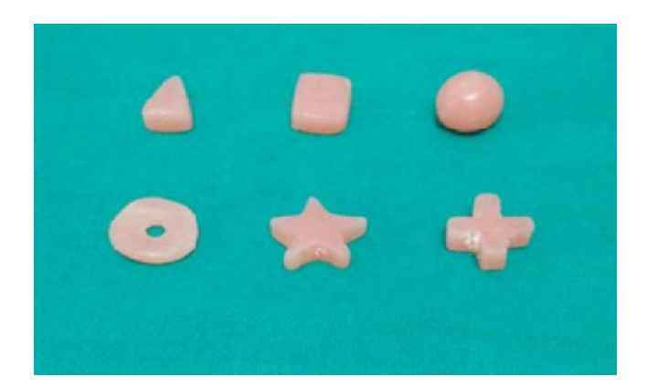
Fig. 1 Different shapes of test specimens In this image six types of shapes made from cold cure acrylic resin was showed

The shapes were first made in wax. These shapes were flasked, dewaxed and packed with heat cured acrylic resin. The shapes were then finished and polished with sand paper.