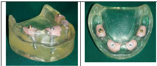
Figure 1. (a) 3D print die with two parallel and two distally inclined implants (b) multiunit abutments screwed onto the implants

This in-vitro study was carried out in The Department of Prosthodontics, The Oxford Dental College, Bengaluru. The measurements on the master cast and on the casts obtained from splinting and non-splinting methods were made using digital vernier caliper in the Department of Physics, Oxford college of engineering. The 3D printed transparent acrylic die that incorporated four replica implants, in the canine and molar region, bilaterally, was used as a master cast. The implants in the canine region were parallel to the vertical axis and the implants in the molar region were distally inclined to the vertical axis. Straight multi-unit abutments were placed over the anterior implants and tightened with a hexagonal screwdriver until resistance was felt. 30-degree multi-unit abutments were placed on the posterior implants and tightened. (Fig.1).