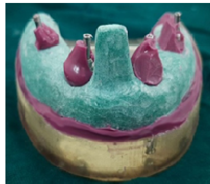
Figure 3. Impression making

Non-splinting technique: Multi-unit open tray impression posts were fixed to the multiunit abutments on the master die. Tray adhesive was then applied evenly over the inner surface of the tray to extend approximately 2mm onto the outer surface along the periphery and then allowed to dry for a few minutes following the manufacturer's instructions. A part of the aquasil monophasic material was meticulously syringed around the impression copings to ensure complete coverage of the copings and the remaining material was loaded onto the impression tray. The tray was then seated on the master die with gentle pressure and allowed to set (Fig3). The impression tray was kept in position with hand pressure throughout the setting time. Five minutes were allowed for the setting of the impression material. The guide pins were removed so that the transfer copings remained in the impression when the tray was removed from the transparent model.