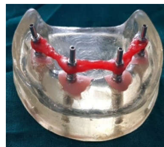
Figure 4. Splinting the impression posts using pattern resin

Splinting technique: For the splinting technique, after the impression posts were fixed to the multiunit abutments, they were splinted using floss and pattern resin. The dental floss was wound around each post in a figure of eight pattern to interlock the transfer-coping complex. Adequate amounts of powder and liquid were dispensed into the respective mixing cups. A small amount of pattern resin powder was picked with the brush that was previously moistened with the monomer liquid. The resin bead formed was then deposited on the floss. This was repeated until the entire surface of the floss was covered with a thin layer of pattern resin (Fig 4). Once the resin splint was polymerized, an open tray impression was made with the aquasil monophasic material.