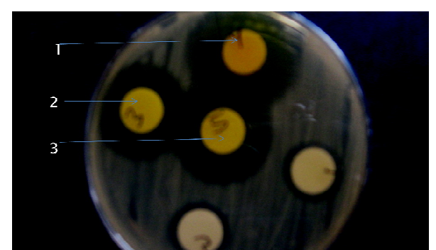
Figure 4. Activity of different actinomycins produced by Streptomyces sp. AH 47 against Bacillus subtilus .

1- actinomycin D, 2- actinomycin X_2 , 3-actinomycin X_{0\beta} .