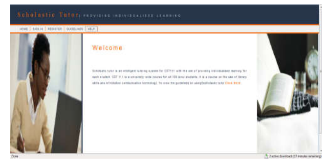
Figure 3: Graphic user interface for the Home page of Scholastic tutor

4. Graphic interface: this is responsible for user interaction with the intelligent tutoring system. It controls the communication between the learners, teachers, and the system as well as following up the behaviours of them. Then the information is sent back to the student module afterwards. IT is the gateway of the system for communicating with the student. All the learning materials and test sets are presented to the student through this interface and test results are fed back to the system for assessing the student.