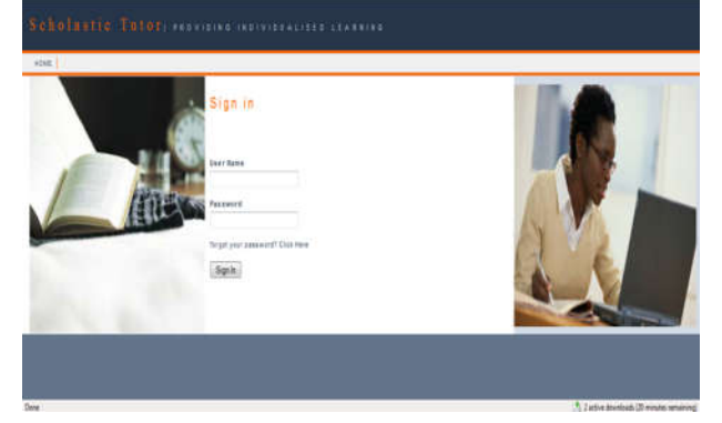
Figure 1: GUI for the sign in page of Scholastic tutor