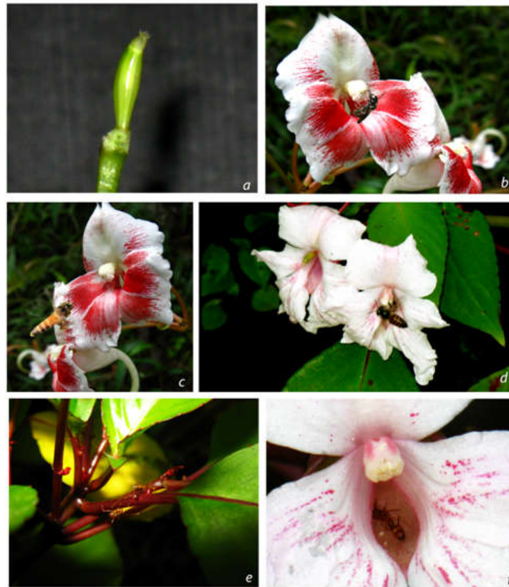
Figure 3. Stigma receptivity and Pollinator observation in Impatiens grandis

a. receptive stigma with star shaped lobes, b. Ceratina cucurbitina pollinating the receptive stigma, c. Apis dorsata landing on the colourfull ventral petal, d. Apis cerana visiting the receptive stigma with pollen load, e. Oecophylla smaragdina -foraging the extra floral nectaries, f. Oecophylla smaragdina entering into the spur to rob the nectar