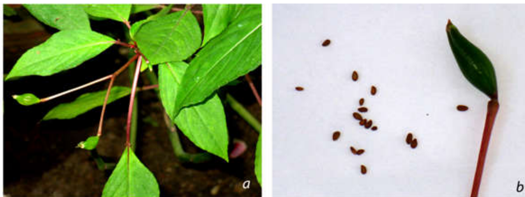
Figure 4. Breeding experiments in Impatiens grandis

a. receptive stigma with star shaped lobes, b. Ceratina cucurbitina pollinating the receptive stigma, c. Apis dorsata landing on the colourfull ventral petal, d. Apis cerana visiting the receptive stigma with pollen load, e. Oecophylla smaragdina -foraging the extra floral nectaries, f. Oecophylla smaragdina entering into the spur to rob the nectar