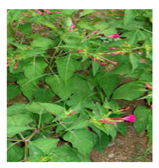
Fig. 1. Photograph of Mirabilis Jalapa Linn

The plant material Mirabilis jalapa Linn (Figure 1) used for this study was collected from Nizamabad district, Telangana State, India. The plant specimen was authentically identified with the help of report of documentation of folk knowledge on medicinal plants (Ghatapanandi et al. , 2011).