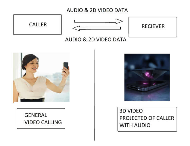
Fig. 1. Projected System Architecture

The system proposed in this paper requires two users who wish to communicate through our 3D calling service to have smartphones at both ends equipped with front cameras and speakerphones. Also a 3D calling service application should be available in both the smartphones. Caller or the sender will make a normal 2D video call to the receiver .So our system will be converting a real-time 2D video into a three dimensional view by calculation of depth cues by algorithms specified in further sections. After calculation of depth cues the resulting image formed is divided into four frames which is then visible on the receivers screen. From these four frames a single elevated 3D image is formed by diffracting through the edges of the prism. The prism is constructed along with the system and is placed exactly in the center of the mobile screen. Audio can be received through speakerphones or headphones