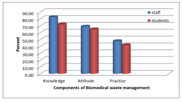
Graph 1. Comparison of knowledge, attitude and practice of biomedical waste management among staff and post graduate students of Oral Pathology and Microbiology