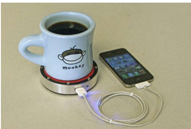
Fig. 1. Example of sustainability

Sustainability is added in terms of multiple ideas and generations of multiple solutions. It helps in creating a global impact in terms of sustainable solution.