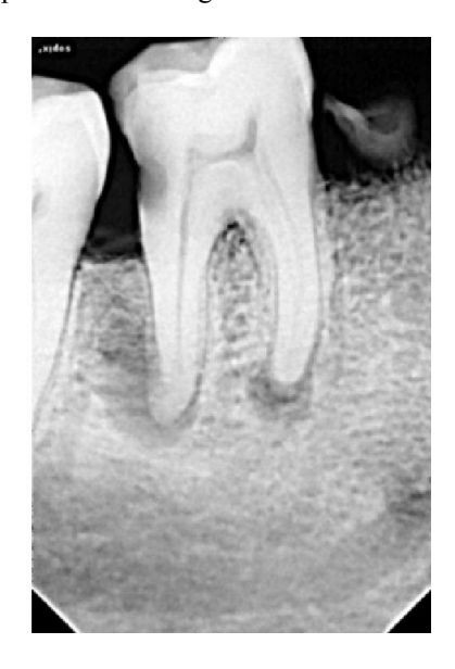
a. Diagnostic RVG