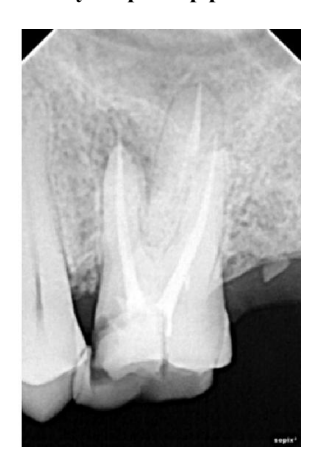
d. 1 year post-op RVG