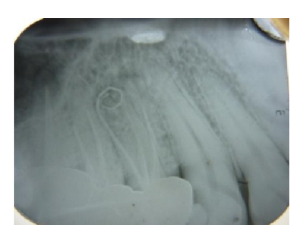
b. Diagnostic X-Ray with tracing GP