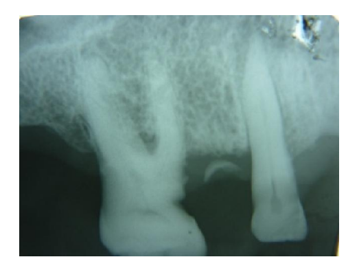
a. Diagnostic IOPA X-Ray

A 32 years old male patient came with a chief complaint of pain & swelling in right lower back teeth region of the jaw since 3 years. He got his RCT done in the same tooth 3 years ago and shortly sfter the treatment was finished, this small swelling appeared which increases and decreases in size with time and drains pus through it.