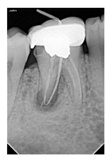
a. Diagnostic RVG with tracing GP

the canal. The patient was happy with complete healing and no pain. After 12 months follow up, radiograph showed the progressive process of healing.