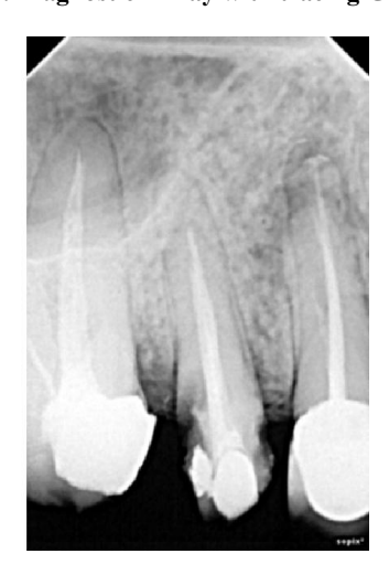
c. 1 year post-op RVG