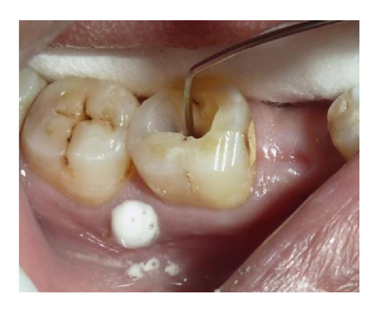
b. Intra-op Ca(OH)2 extrusion through sinus tract