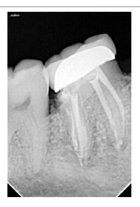
c. 1 year post-op RVG