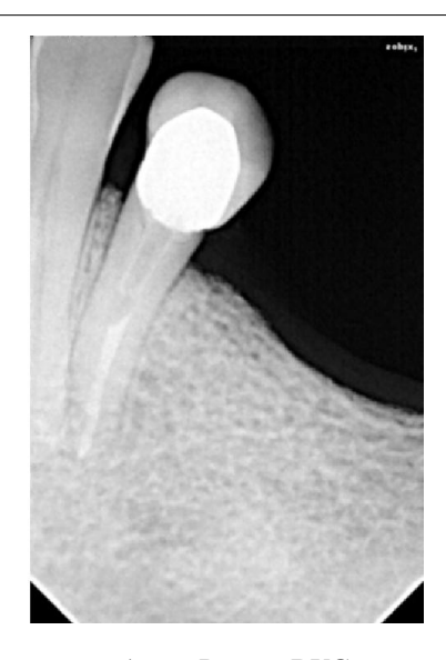
c. 1 year Post-op RVG