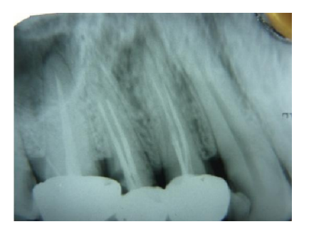
a. Diagnostic IOPA X-Ray

in association with 14. Careful examination revealed intraoral draining sinus tract on the buccal gingiva of the right maxillary premolars. Sinus tracking was done with the help of gutta percha and on radiographic examination we could find out the presence of sinus tract with respect to maxillary right 1st premolar. Both the premolars were RC treated some 4-5 years ago. Endodontic therapy was planned for 14. Crown was removed. Working length was determined and the apex was perforated with 15 no K file. Canals were then shaped with manual protapers (DENTSPLY) using crown down technique upto the finishing file #20(F1). During the preparation, the canal was irrigated copiously with normal saline and 2.5% sodium hypochlorite. Canals were then dried with sterile paper points. Injectable calcium hydroxide was placed in to the canals and forced intentionally through the apex until visible through the other end of the sinus tract. Acess cavity was sealed with cavit. Patient was recalled after 1 week for evaluation. On next visit the tooth was asymptomatic and healing of sinus tract was evident. She was then recalled after a week for obturation of the canals. The patient was happy with complete healing and no pain. After 12 months follow up, radiograph showed the progressive process of healing.