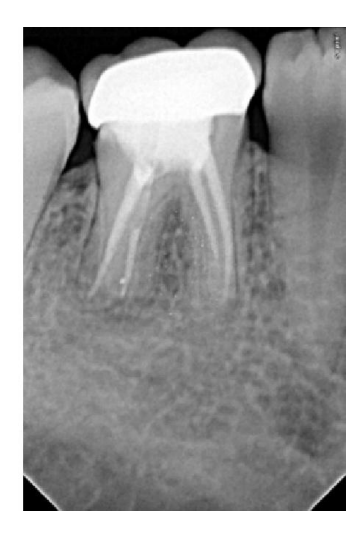
b. 1 year post-op RVG