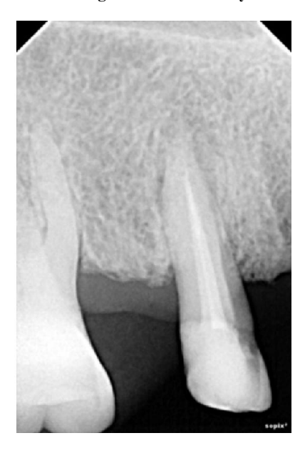
b. 1 year post-op RVG

The 1st molars was slightly tender on percussion. Sinus tracking was done with the help of gutta percha and on radiographic examination we could find out the presence of sinus tract with respect to mandibular right 1st molar. The radiograph also showed 2 distal roots (Radix Entomolaris). Re-RCT was planned for the case. The crown was removed and old amalgam filling over the access cavity was also removed. 4 canals were found in total and Disto-lingual was missed last time. Working length was determined and the apex was perforated with 15no K file. Canal was then shaped with manual protapers (DENTSPLY) using crown down technique upto the finishing file #25(F2). During the preparation, the canal was irrigated copiously with normal saline and 2.5% sodium hypochlorite. Canal was then dried with sterile paper points. Injectable calcium hydroxide was placed in to the canal and forced intentionally through the apex until visible through the other end of the sinus tract. Acess cavity was sealed with cavit. Patient was recalled after 1 week for evaluation. On next visit the tooth was asymptomatic and healing of sinus tract was evident. She was then recalled after a week for obturation of