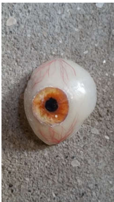
Fig. 7. Definitive Prosthesis