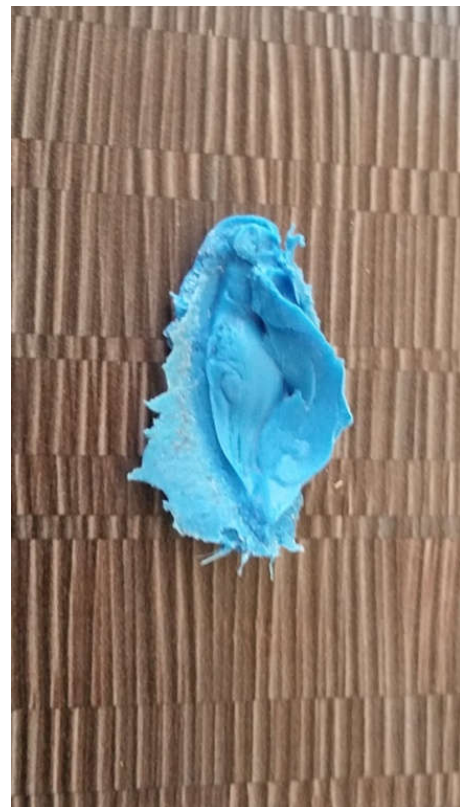
Fig.2. Primary impression