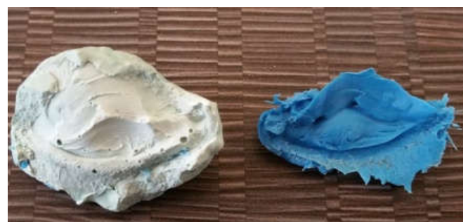
Fig.3. Primary cast with the impression