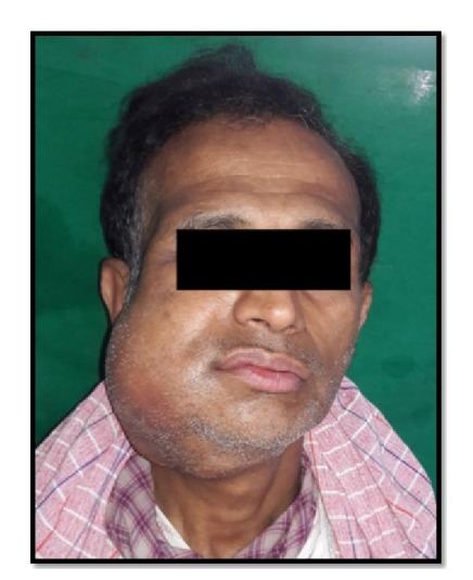
Photograph 1. Front profile of the patient showing a diffuse swelling of right side of face which is more prominent in parotid and submandibular gland region