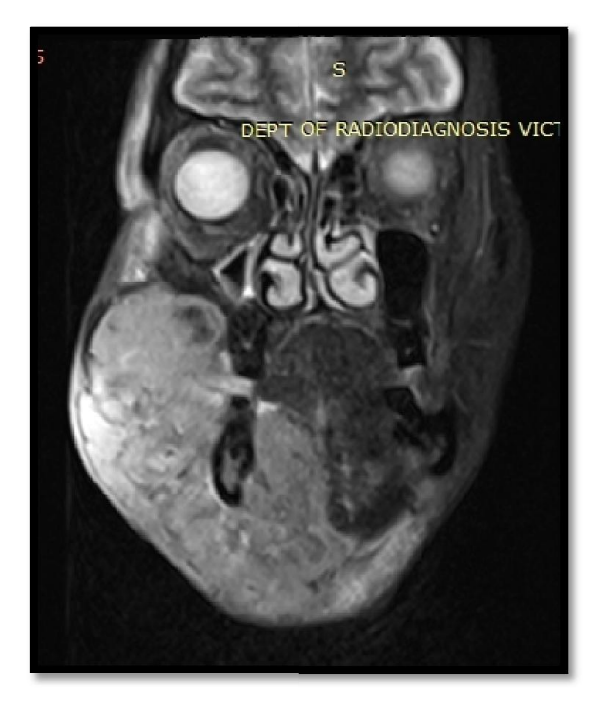
Photograph 4. MRI of neck showing an ill – defined peripherally enhancing T1 isointense and T2 hypointense lesion in right side of neck