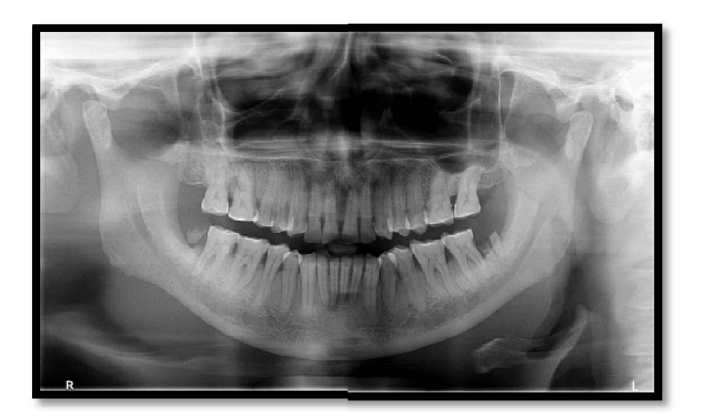
Photograph 2. Panoramic radiograph showing root stump irt 48 with no evident periapical pathology