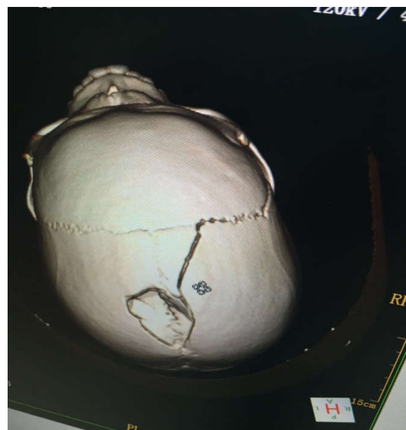
Figure 2. Brain Fall injury