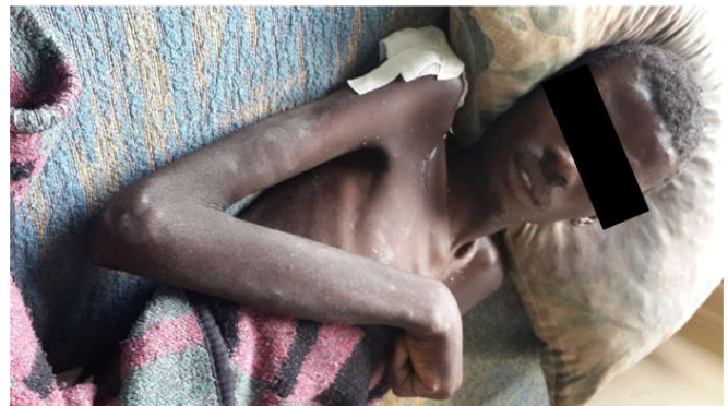
Figure 5. Right hemiplegia

The patient further developed right hemiplegia