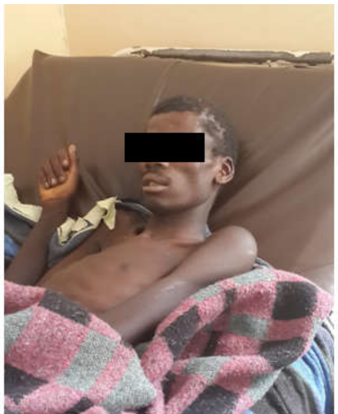
Figure 6. Right hemiplegia

Throughout his hospital stay, the patient did not receive any visit from any family members nor from a friend. His condition slowly began to deteriorate as he developed bed sores and was not feeding well. He further developed contractures in all limbs.