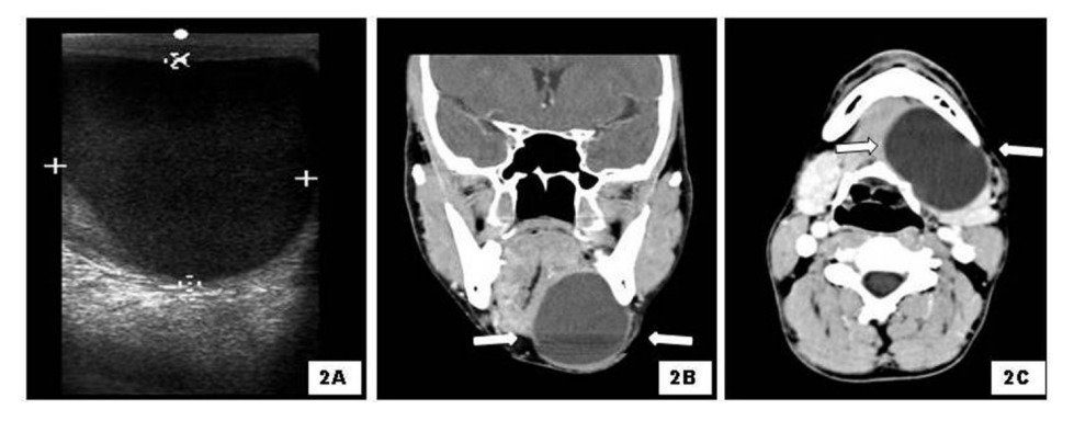
Fig. 2A - Ultrasonography showing a hypoechoic lesion. Fig. 2B - CT scan (coronal view) showing a hypodense lesion (white arrow). Fig. 2C - CT scan (axial view) showing a hypodense lesion (white arrow)