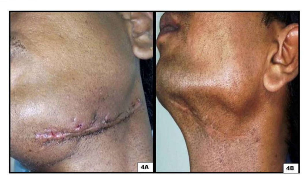
Fig. 4A - Followup of the patient after 15 days, Fig. 4B - Follow up of the patient after 6 months