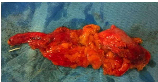
Fig 3. Specimen showing LEFT KIDNEY, URETER & IUCD