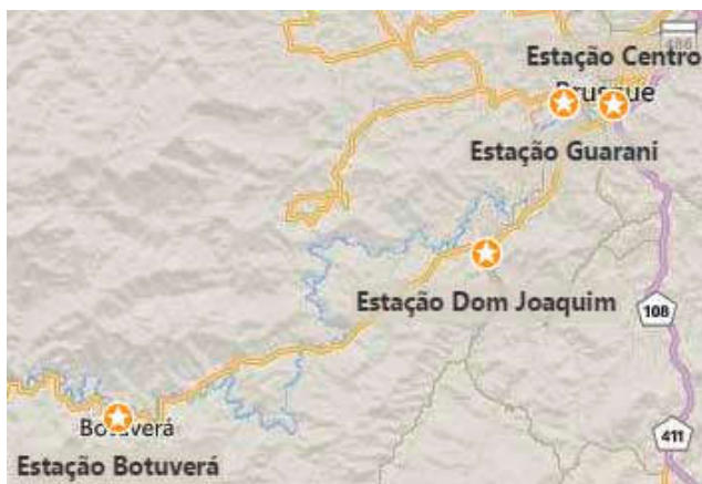
Fig.1. Main telemetry stations location

Figure 1. A map with the location of the main telemetry stations in the region