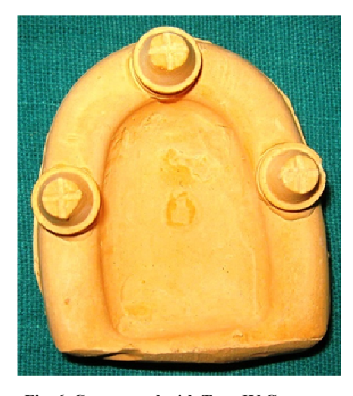
Fig. 6. Cast poured with Type IV Gypsum