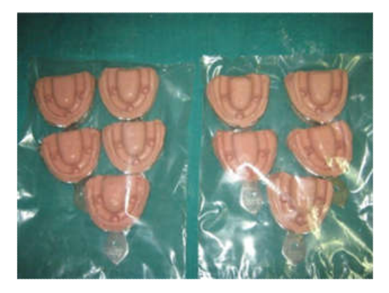
Fig. 5. Impressions stored in air sealed plastic bag