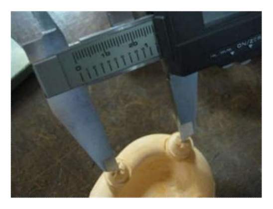
Fig. 7. Dimensions measured with vernier caliper