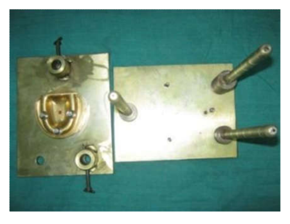
Fig. 2. Master model with impression zig apparatus