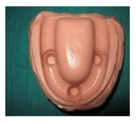
Fig. 4. Alginate impression of the master model