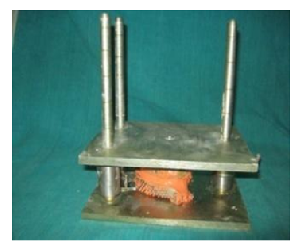
Fig. 3. Alginate impression with the zig