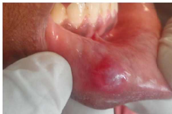
Immediate post operative photograph