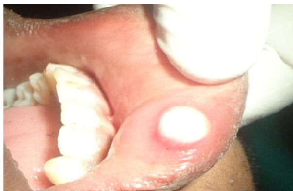
1 Week post operative