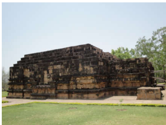
Fig. 2. Lateral view of Bhimkichak temple