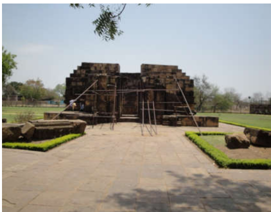
Fig. 1. Front view of Bhimkichak temple