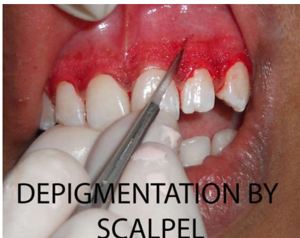
Figure 2. Epithelium and a layer a connective tissue removed