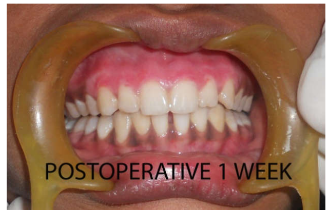
Figure 5. Follow up after 1 week