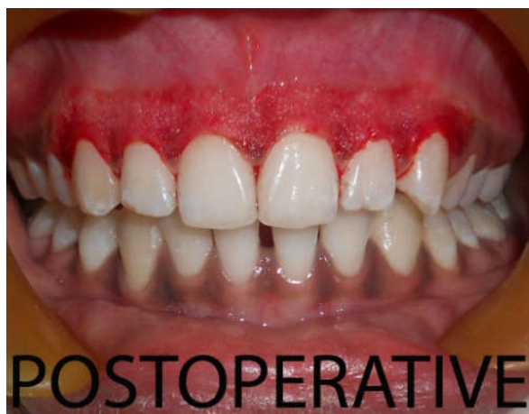
Figure 3. After complete removal of epithelium