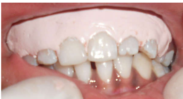
Figure 4. Placement of periodontal pack