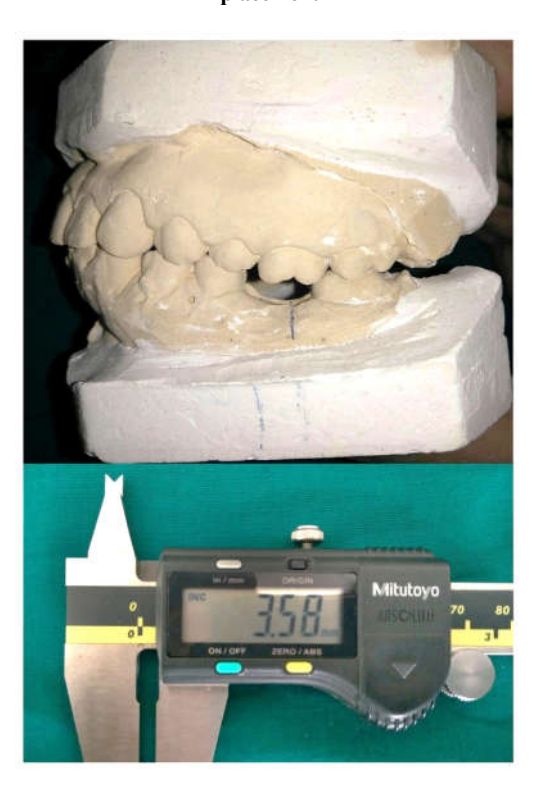
Fig.2. Pre-treatment cast showing CHS reduced to 3.58 mm