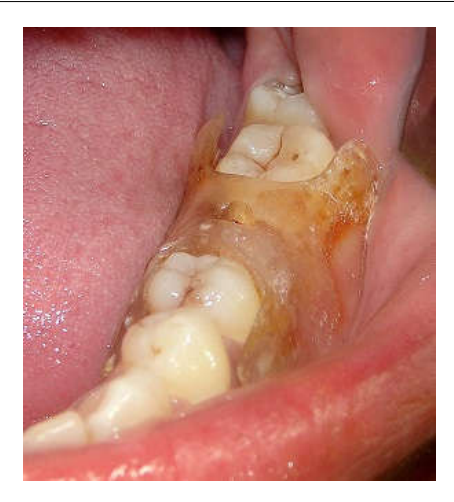
Fig.3. Surgical stent for implant placement