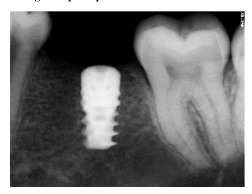
Fig.5. Radiovisuograph with dental implant