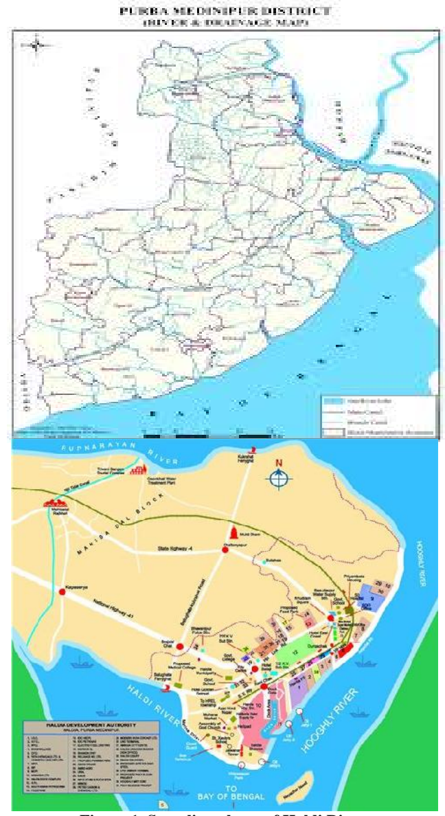
Figure 1. Sampling places of Haldi River

the sequence of Pb> Cu > Zn > Cd at that site. Maximum amount of metal found in sample water was lead (Pb). The values of lead observed 4.175 \mu g/L.