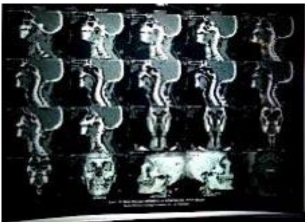
Fig. 2. Sagittal section of CT Scan showing lesion in maxilla