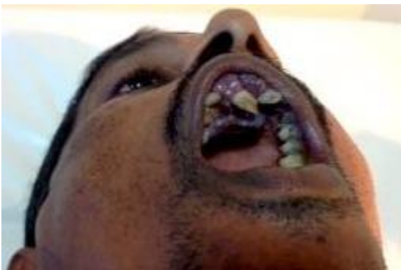
Fig. 1. Intraoral view of melanoma

black in colour, ulcerated with irregular borders, soft in consistency with mild bleeding and tender on palpation. On physical examination, no clinically atypical or suspicious nevi were observed on the skin or scalp. Teeth in the area of growth were mobile and in malocclusion. On palpation of the neck, enlarged regional lymph nodes were detected. Based on the history and clinical features, the lesion was provisionally diagnosed as primary mucosal malignant melanoma involving the hard palate. Routine blood investigations were done which were within normal limits. Incisional biopsy was done and histopathology report confirmed the diagnosis of malignant mucosal melanoma. Immunohistochemical analysis revealed that the lesion was positive for HMB-45, Melan-A, S-100 further confirming the diagnosis of malignant melanoma. Computerized tomography [CT] scan revealed the extent of lesion in maxilla in all the planes with bony destruction and showed presence of regional lymph node involvement [Fig 2, Fig 3].