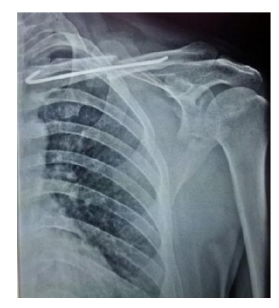
Fig. 3. Post-op xray 30 yr male with fracture clavicle and scapula left side, clavicle fixed with TENs nail