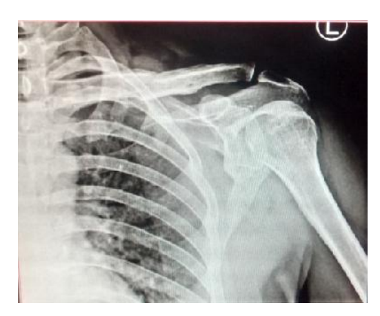
Fig. 4. 14-week post-op xray 30 yr male with fracture clavicle and scapula left side after-union TENs nail removed