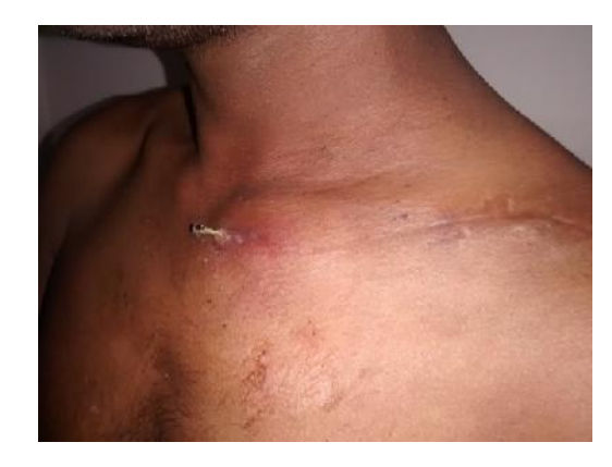
Fig. 9. Pin tract infection

Functional outcome was assessed by the Constant score. In the Constant scoring system, the overall grading is excellent if the total score ranges from 90 to 100, good for 80–89, fair for 70–79, and poor if the scores are 69 or less. At final evaluation, the overall results using the constant score were 38 excellent and 12 good results.