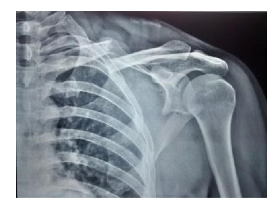
Fig. 2. Pre-op xray 30 yr male with fracture clavicle and scapula left side