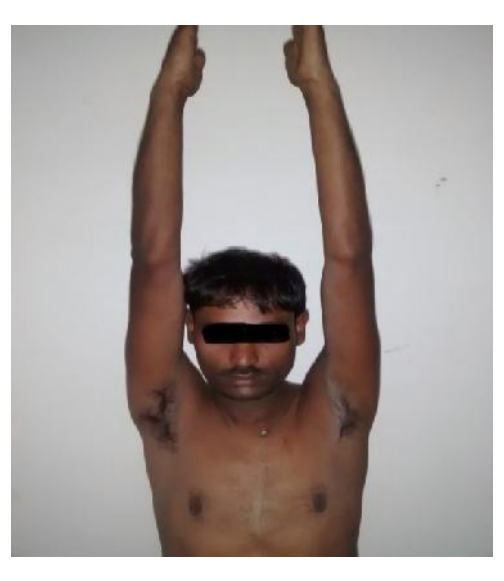
Fig. 6. Shoulder ROM after 8 week post fixation