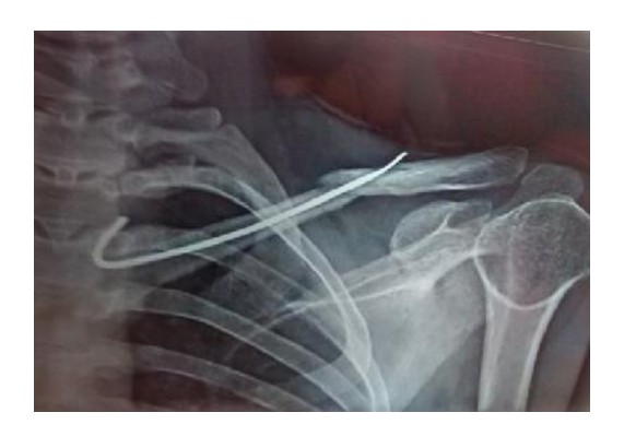
Fig. 8. Perforation of lateral cortex