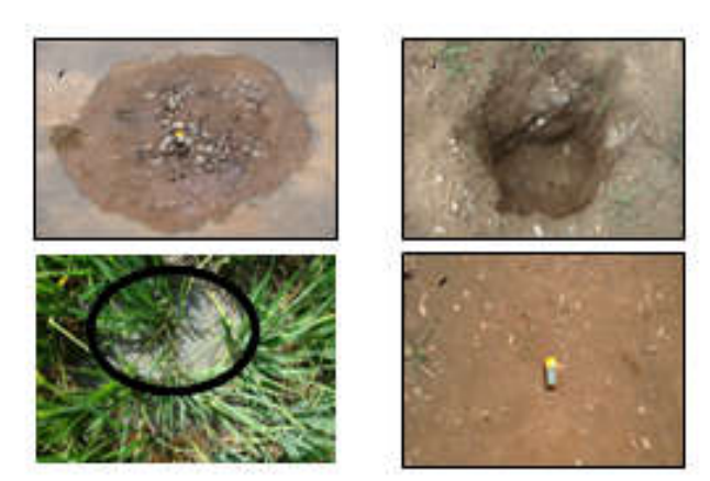
Fig.1. Field photographs of the impact sites (a) Attakurkki crater (b) Gangapuram crater (c) A. Kottur(d) Rathupalli