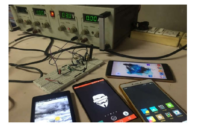
Fig.2. Connection and respective mounting for the project