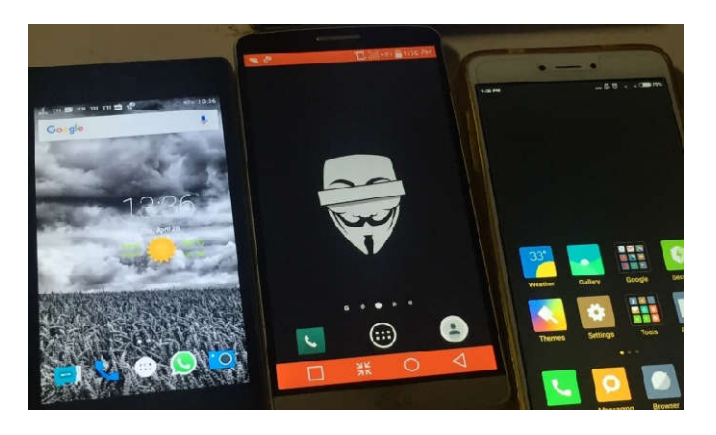
Fig.3. Signals Jammed (no signal on mobile)