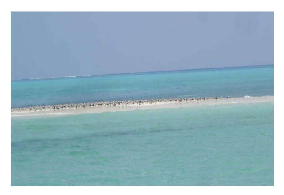
Figure 4. Thinnakara Island with Terns