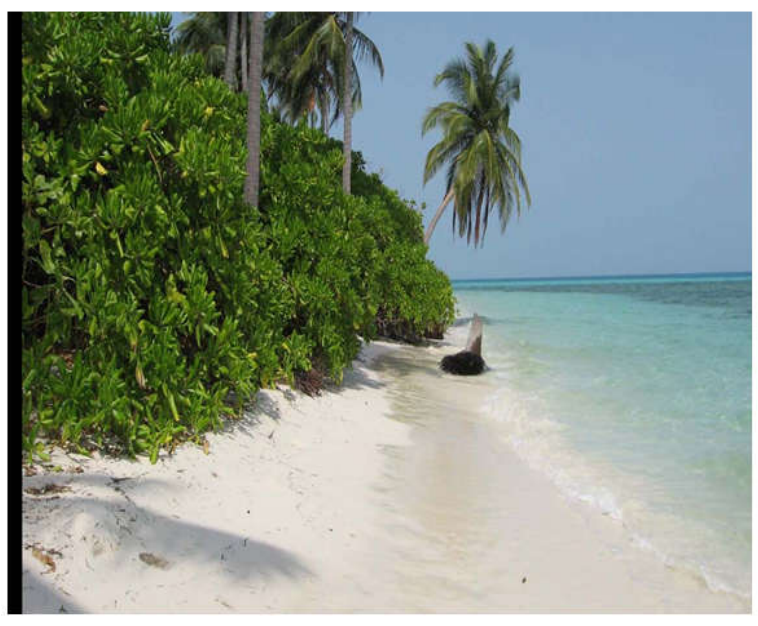
Figure 3. Sandy Beach of Bangaram Island