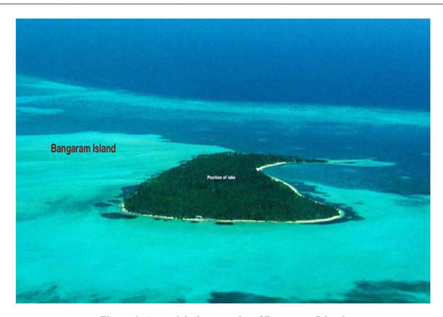
Figure 1. An aerial photography of Bangaram Island