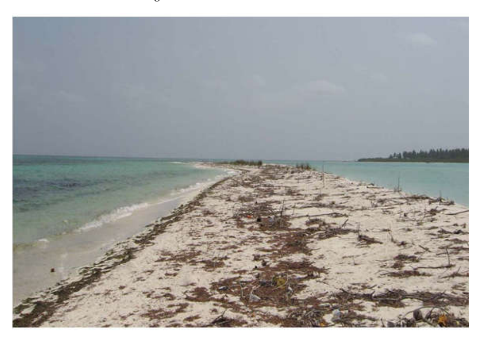
Figure 5. Thinnakara Sand bar exposed during low tide

Common Greenshank (Tringa nebularia), Wood Sandpiper (Tringa glareola) and Marsh Sandpiper (Tringa stagnatillis) were the most abundant shore-birds observed in the Bangaram. Out of the 19 species identified from the Thinnakara Island, 6 species were shorebirds. Ruddy Turnstone (Arenaria interpres) was the most abundant species among the shorebirds. Family laridae represented with 11 species is the most speciose family at Thinnakara. Gent (2007) had identified 150 species of birds from Bangaram reef. But our survey noticed only 55 species of birds. Gent (2007) reported 11 species of Terns at Bangaram reef, including Bridled Tern and White-cheeked Tern but We found only Lesser Crested Tern and Large Crested Tern. The Common Tern, Sandwich Tern and Gullbilled Tern are the new addition to Bangaram Reef. Pande et al. (2007) reported Pond Heron, Asian Koel and Barn Swallow in Bangaram, but we were unable to find these birds during the present survey. In Thinakkara we spotted mainly terns. Bartailed Godwit, Green Sandpiper, Spotted Sandpiper, Terek Sandpiper, and Pond Heron, recorded by pande (2005) were not sighted here now. Regarding the conservation, a detailed management plan has to be developed for Bangaram reef. A comprehensive monitoring