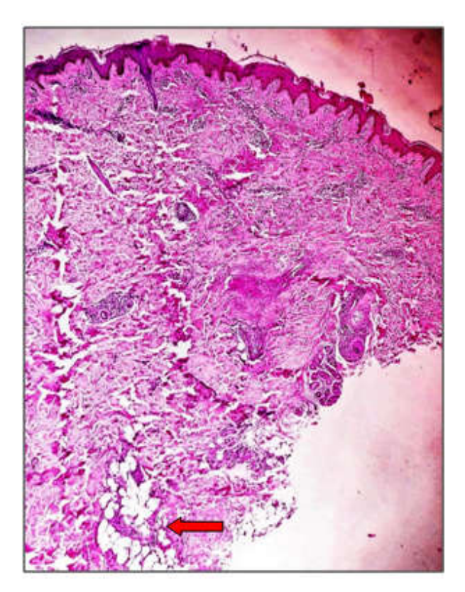
Fig 1. Mictophotograph shows superficial and deep perivascular infiltrate in the dermis as well as subcutaneous fat showing panniculitis (arrow). (4x, H & E stain)

lower extremities. On examination ulcer was present over the mucosal aspect of upper lip with scarring over the genitalia. Multiple tender nodules were present over the anterior aspect of leg. Systemic examination including the ophthalmic examination was normal. Routine laboratory investigations were within normal limits.