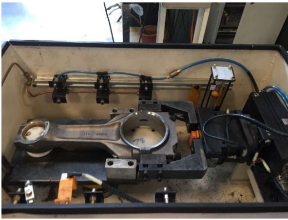
Figure 1. Washing and Cleaning Unit