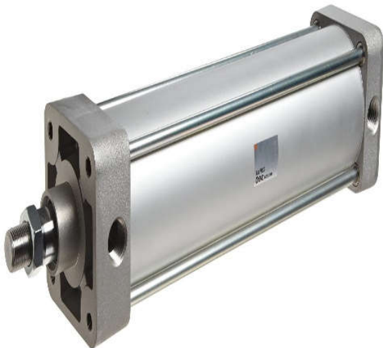
Figure 2. Pneumatic Cylinder

Pneumatic cylinder: It is primarily used to control the movement of door and provides reciprocating motion to the rest pad in desired time interval (Jun Lia et al. , 2013). Schematic diagram of pneumatic cylinder shown in Figure 2.