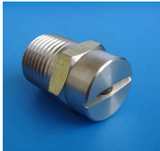
Figure 3. Flat Jet Spray Nozzle

Flat Jet Spray Nozzle: Flat jet spray nozzles are designed for high pressure washing application. Their specially designed inner profile allows for even jet distribution, which results in effective and uniform cleaning action over the surface being processed (John Durkee, 2009). It is ideal for Degreasing and Rinsing in industrial washing machine. Jet spray nozzle is shown in Figure 3.