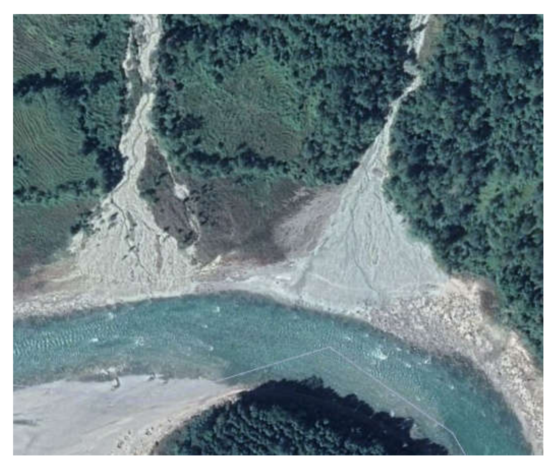
Plate 4. Alluvial Fans along the River Tista