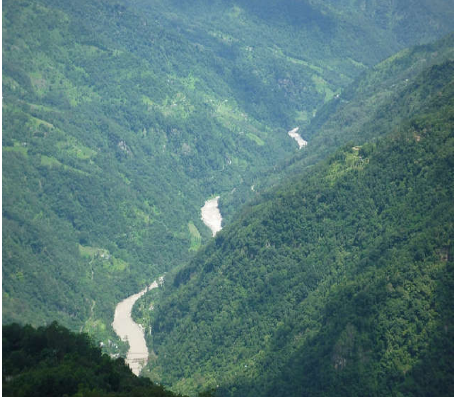
Plate 1. V-Shape valley, Tista River