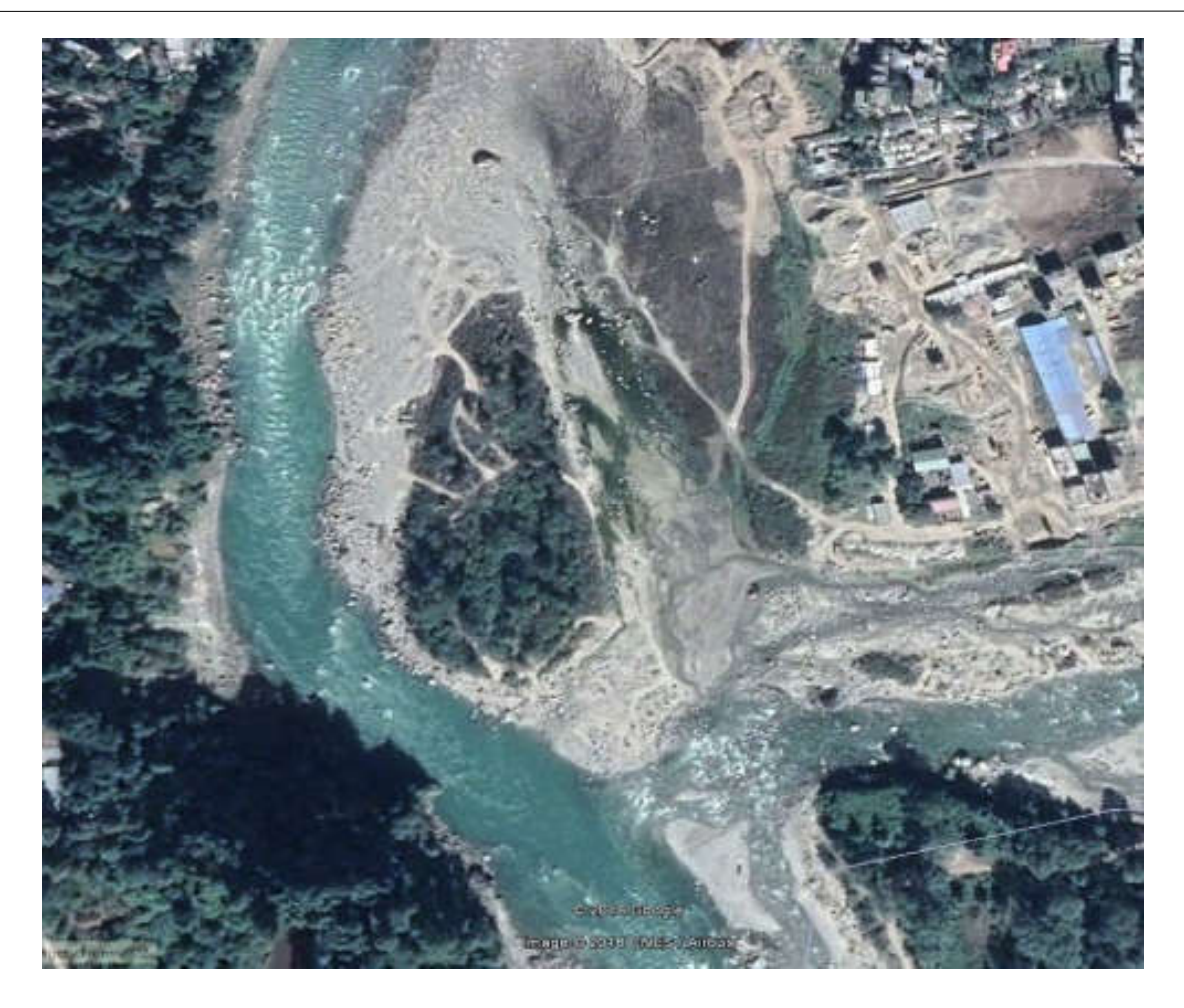
Plate 3. Formation of Natural Levee