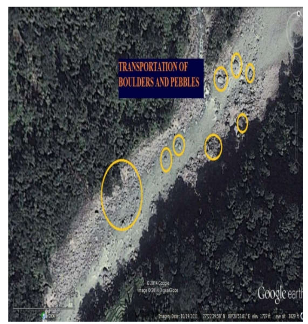
Plate 2. Transportation of Sediments, Tista River

A river starts depositing its load when its velocity is reduced and it is incapable of transformation the entire material being carried by it. A river depositing its load which the amount of load being carried exceeds its transportation capacity. Reduction in its capacity generally a result of a reduction in its velocity and the river is incapable of carrying its present load at the lower velocity, so its start depositing.