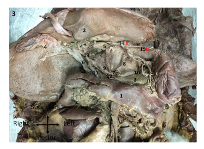
Fig 3- Variation in branching pattern of the CT arising from the abdominal aorta.CT was divided into left gastric artery, splenic artery and common hepatic artery. Note the left gastric artery gave an acessory left hepatic artery which was supplying left lobe of liver and cardiac part of stomach.1-Stomach.2-Left lobe of liver.3-Pancreas.4- Gall bladder.5-Caudate lobe of liver,6- Common bile duct,7- Coeliac trunk,8- Left gastric artery,9- Common hepatic artery,10- Splenic artery,11- Gastroduodenal artery,12- Right gastric artery,13- Hepatic artery,14-(#) Accessory left hepatic artery,15-(#) Cardiac branch from accessory left hepatic artery