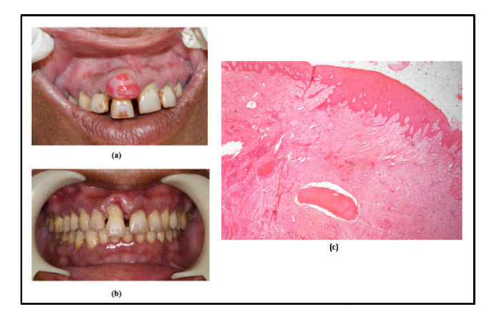
Figure 2: (a) Clinical photograph of solitary gingival swelling on right anterior maxilla in case 2. (b) IOPA in relation to 12, 13 showing mild bone loss. (c) Histopathology of the lesion showing highly cellular connective tissue and mature lamellated bone marked by black arrows (H & E, 10x).