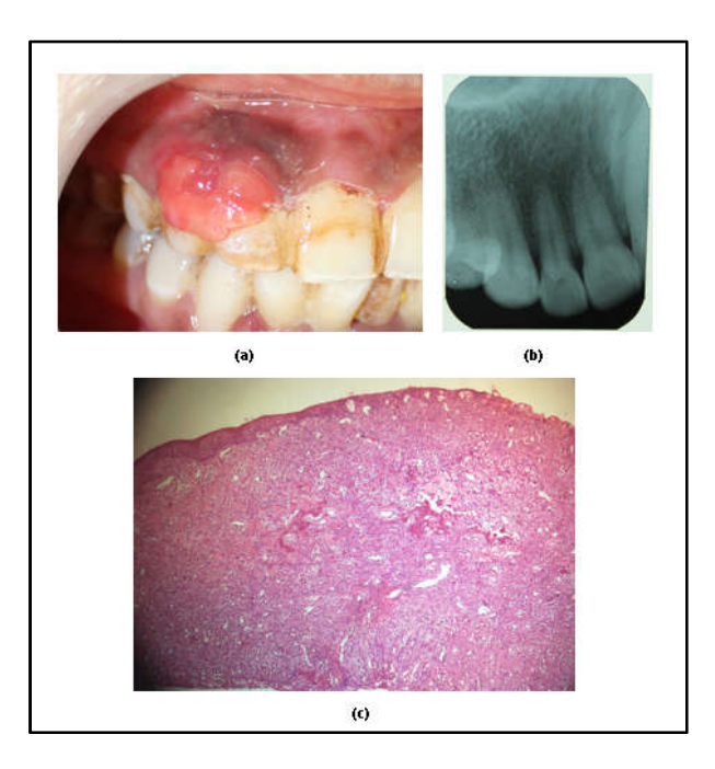
Figure 2. (a) Clinical view the lesion. (b) IOPA in

maxilla and mandible. Clinically, POF usually manifests as a well-defined and slow-growing gingival mass measuring under 2 cm in size and located in the interdental papilla region. The base may be sessile or pedunculated, the color is identical to that of the gingiva or slightly reddish and the surface may appear ulcerated (Kale et al., 2014). The lesion shows a sex predilection toward female and most commonly occurs in the second and third decades. Most commonly, they found in the maxilla and anterior to the molars, but numerous variations have been reported in literature (Buchner, 1987). Approximately 60% of POFs occur in the maxilla, and they occur more often in the anterior than the posterior area, with 55%-60% presenting in the incisor-cuspid region (Zhang et al., 2007). The etiology and pathogenesis of POF are not yet clear. POFs are believed to arise from gingival fibres of the periodontal ligament as a result of irritating agents such as dental calculus, plaque, orthodontic appliances, and ill-fitting restorations (Mergoni et al., 2015).