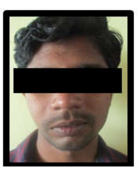
Fig 1. Extra oral