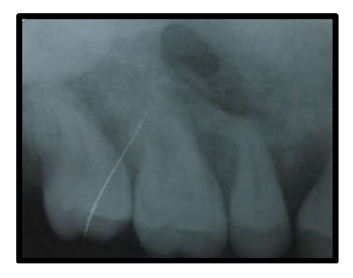
Fig. 5-IOPA 14,15 16,17 region