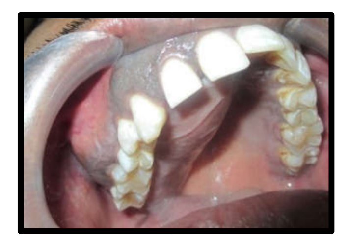
Fig. 4. intra oral