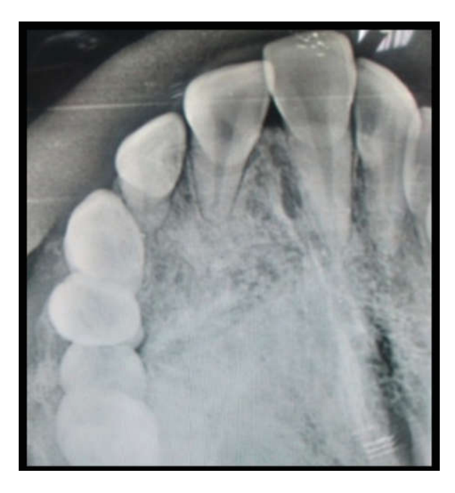
Fig. 6. Occlusal view

shape, ill defined margins, mucosa over the swelling surrounding structures appeared to be normal (fig.4). On palpation it was non tender, bony, hard in consistency without secondary changes.