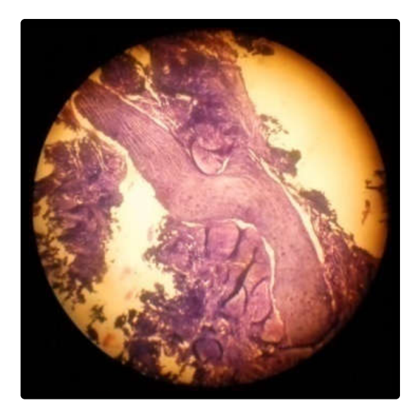
Fig. 8. Histopathology section

Routine hemogram and biochemical were normal. IOPA in relation to 14,16,17 region revealed the presecence of a radiopaque mass present in relation to 14,15,16,17 region with diffuse in nature, flaring of roots with ground glass appearance (fig.5). Diffused radiopacity seen with buccal and palatal expansion extending from 13 to 18 region (Fig 6) PNS view revealed diffuse radiopacity present on right maxilla extending from premolar to maxillary tuberosity and involved the floor of maxillary antrum (Fig 7). On the basis of clinical findings and radiographs the case was provisionally diagnosed as a beningn fibro osseous lesion with differential diagnosis of Paget's disease, and fibrous dysplasia were suspected. Histological diagnosis was fibrous dysplasia (Fig 8). Biopsy performed in right maxilla confirmed the diagnosis of FD. The patient was adviced surgical correction of the lesion; however he was lost follow up.