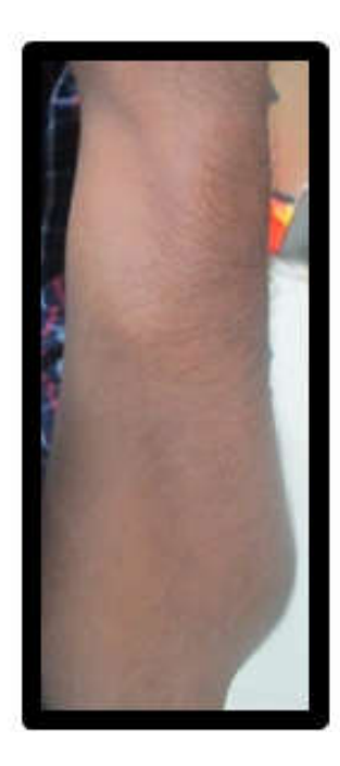
Fig 2. Left elbow