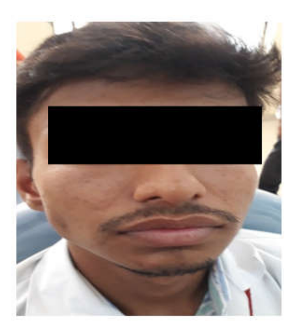
Fig. A. Extraoral picture of the patient