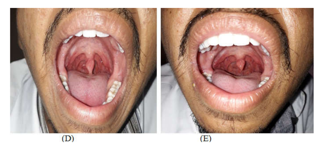
Fig. (D) shows reducing in size and length after 3 days; (E) almost normal after 10 days