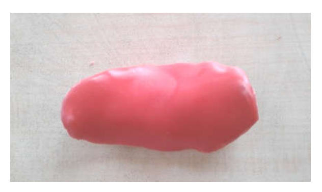
Fig. 5. Wax spacer adapted on working cast of right elbow