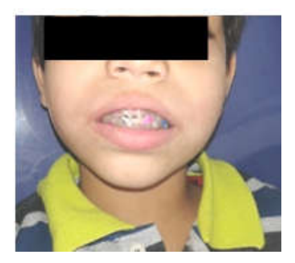
Fig. 9. Patient wearing the vestibular screen