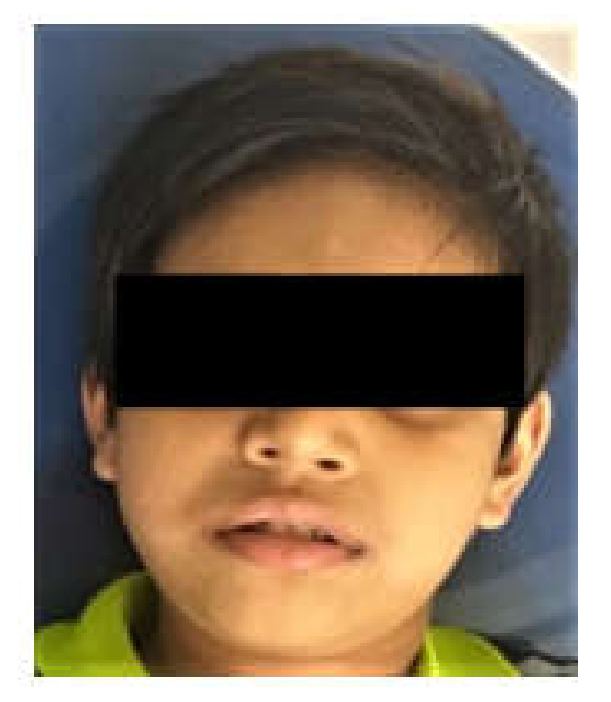
Fig. 10. Follow-up photograph after 6 months showing normal lip appearance

Uniqueness of this case lies in the fact that till now literature reports the use of this appliance with regard to management of