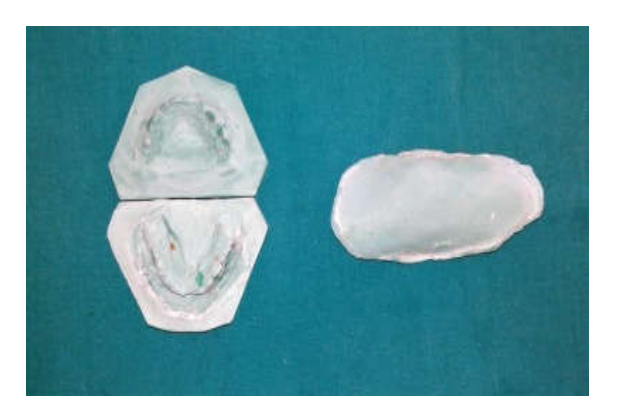
Fig. 4. Maxillary and mandibular casts alongwith cast of the right elbow