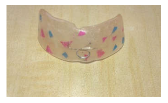
Fig. 8. Vestibular screen after fabrication with self-cure acrylic resin