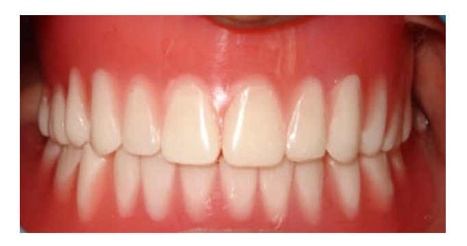
Fig 5. Final placement of the removable complete denture prosthesis

Placement of nylon processing insert into each of the housings was done with insert seating tool. Seating of the attachment housing onto each ball type abutment was done (Fig. 4). Undercuts were blocked out under the housing and soft tissue to prevent acrylic resin from locking the denture onto the abutment. Application of self-curing acrylic was done into recessed area. Denture was inserted and the patient was trained to close in centric occlusion with the opposing arch. After the curing of acrylic, denture was removed. Excess acrylic was removed around the housings and later it was polished (Fig. 5). Processing inserts were replaced by nylon inserts into the housings. Over denture was seated over the ball abutments (Fig. 6). Proper instructions were given to the patient on insertion and removal of prosthesis. The patient was recalled for follow up appointments.