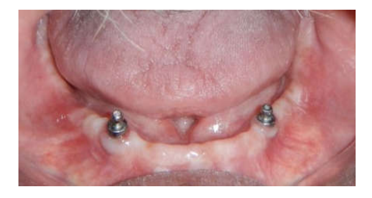
Fig. 3. After 2 weeks, healing abutment were replaced with ball abutments