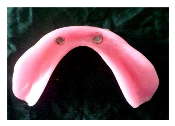
Fig. 4. After the acrylic has cured, removal of denture is done and polished