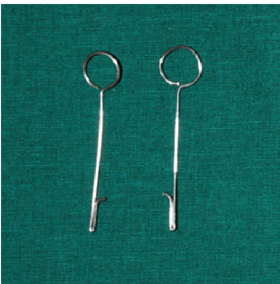
Figure 4. Wire segments bent with a helix and a double back