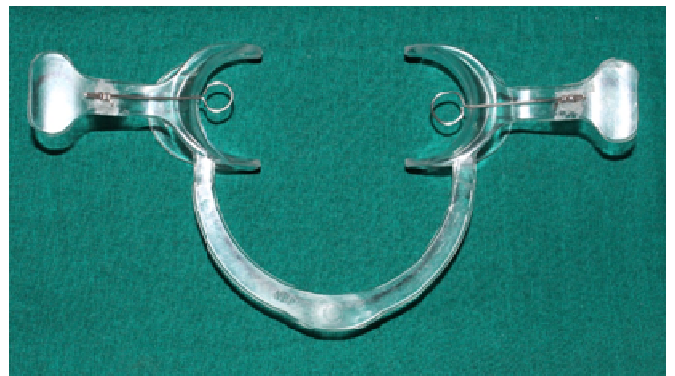
Figure 5. Wire segments attached to the cheek retractor by placing the double back through the palatal sheath