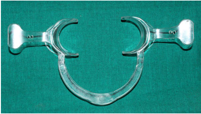
Figure 2. Two holes made in each of the wings of the cheek retractor