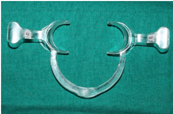
Figure 3. Palatal sheaths fixed on the cheek retractor using chemically cured bisGMA resin