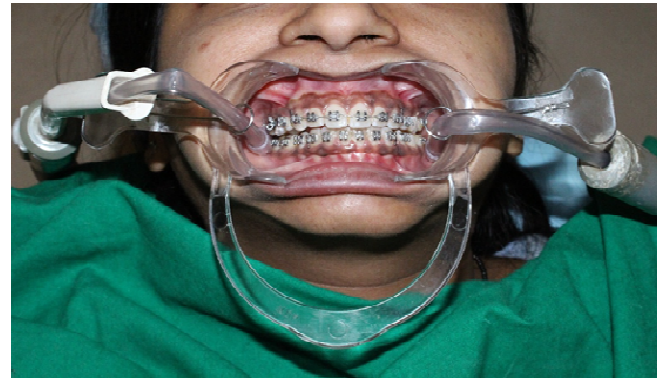
Figure 6. The versatile cheek retractor in use